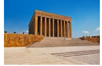
Anıtkabir, Ankara The capital of Turkey