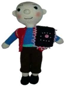
Mascot, name's Keloğlan