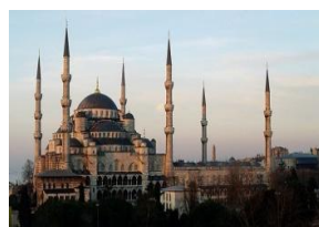
İstanbul, Blue Mosque