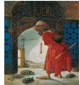
Osman Hamdi Bey, national artist