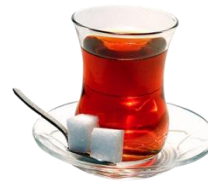
Traditional drink, ÇAY