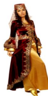
Bindallı, Traditional costume