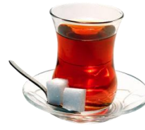
Traditional drink, ÇAY