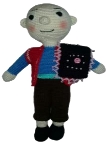
Mascot, name's Keloğlan