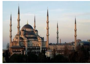
İstanbul, Blue Mosque