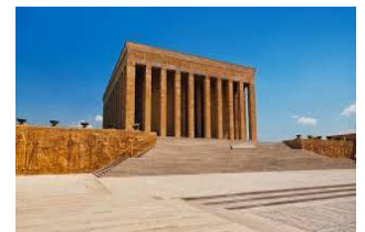
Anıtkabir, Ankara The capital of Turkey