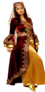
Bindallı, Traditional costume